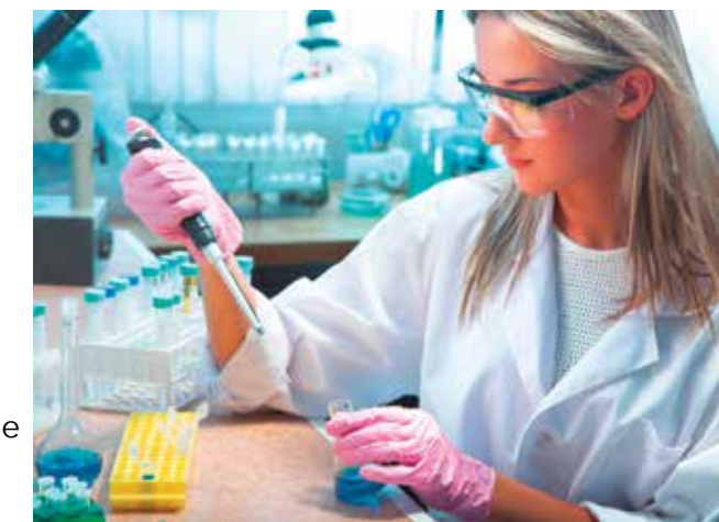
Factory trained technicians who are able to calibrate and repair all brands

Addressing Chapter 41 of the US Pharmacopeia in regards to scales and balances uncertainty budget