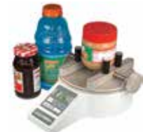
BOTTLE CAP TESTERS