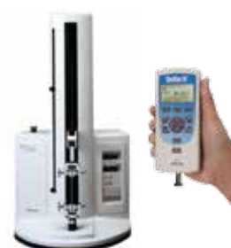
TEST STANDS AND FORCE GAUGES