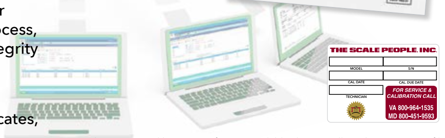
The new ISO calibration certificate is available electronically and our protective film calibration labels ensure the integrity of your information