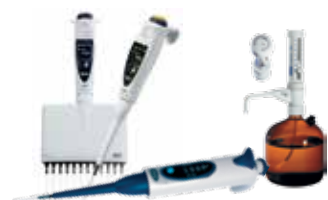
PIPETTES & LIQUID HANDLING